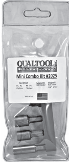
Mini Combo Kit Part No. 2025 Set Includes: Magnetic Bit Holder Magnetic Nutsetters 1/4" & 5/16" Phillips Bits #1 & #2 Slotted Bits #4 & #6