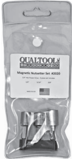
3 Piece Magnetic Nutsetter Set Part No. 2020 Set Includes the following sizes: 1/4", 5/16", 3/8"