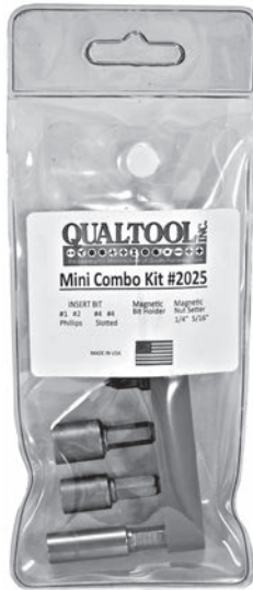
Mini Combo Kit Part No. 2025 Set Includes: Magnetic Bit Holder Magnetic Nutsetters 1/4" & 5/16" Phillips Bits #1 & #2 Slotted Bits #4 & #6